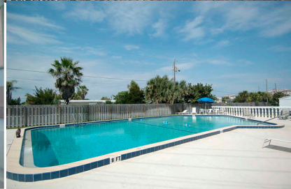
Community Swimming Pool