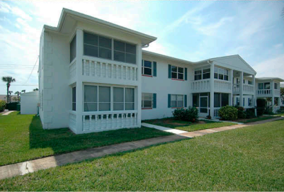
Front View of Condo